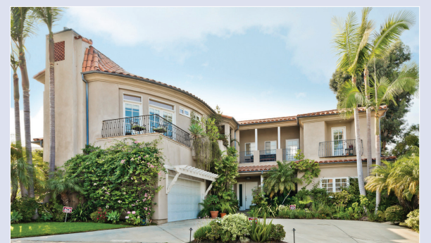
2839 Medill Pl $11,000 Per/Mo. 5 Bed / 4 Bath 3,703 Sq. Ft., 7,953 Sq. Ft. Lot