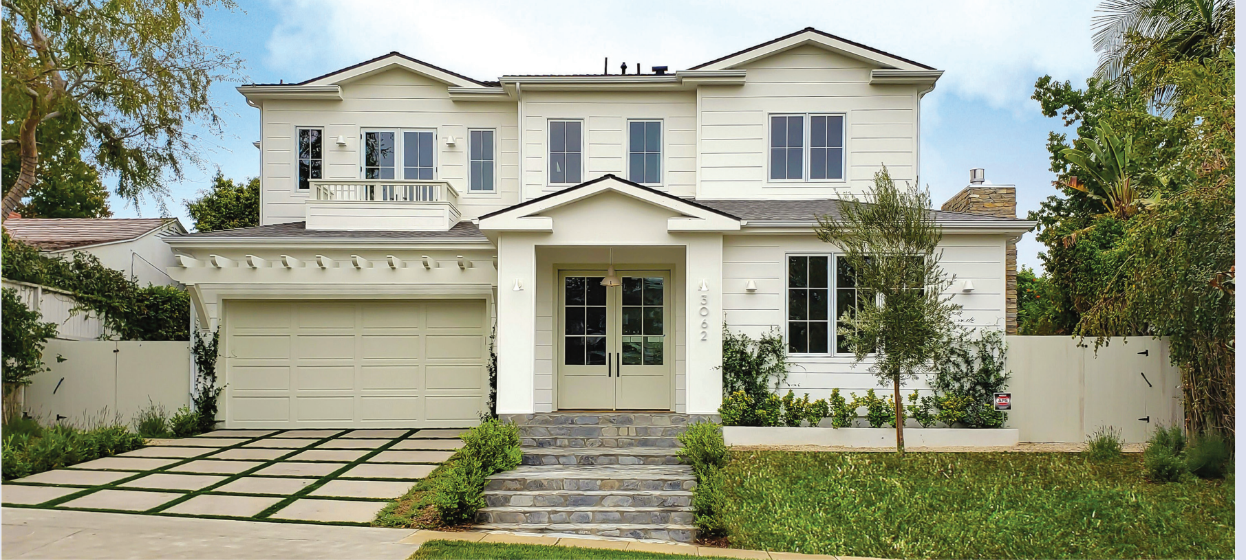
3062 Earlmor Dr 6 Bed / 9 Bath $6,995,000

A magnificent brand new construction on one of the most coveted streets in the Country Club Estates section of Cheviot Hills, this astounding 6 bedroom/9 bathroom home is a true sight to behold. Unique design flourishes really set this traditional style home apart from the pack and it manages to feel warm and intimate despite it's vast 7,000 + square foot size. Stone entry leads to a hard wood open floor plan that allows a breezy flow from room to room. A Butler's pantry connects the formal living room and formal dining to the ultra modern kitchen- a sleek vision in immaculate white. Even the custom Viking appliances have been finished in white for an overall clean, polished look.