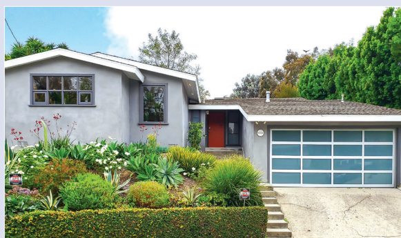
9906 Girla Way $2,495,000 3 Bed / 3 Bath 2,481 Sq. Ft., 10,139 Sq. Ft. Lot