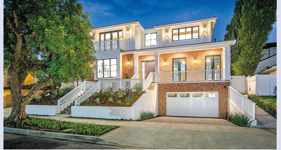
2250 Guthrie Circle – $6,795,000 8 Bed / 10 Bath 9,068 Sq. Ft., 8,564 Sq. Ft. lot

A Nantucket-style showplace, newly built with unparalleled craftsmanship and an incomparable view of the Rancho Park Golf Course is a true neighborhood gem. An extra wide entryway leads to an open floor plan in which the formal living room, glass enclosed wine room and dining room seamlessly blend into a cohesive, shared space. Stylishly designed and fully functional for a busy family, the kitchen offers stainless appliances and a marble countertop island. Located in the highly coveted Overland Elementary School district with convenient proximity to the shops and restaurants of Pico Boulevard, this inspired home is a perfect example of how a property can effortlessly combine style, function, comfort and class.