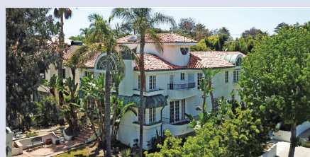
3035 Queensbury Dr – $2,999,000