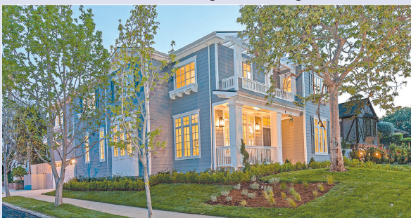
10452 Lorenzo Place – $4,855,000

5 Bed / 7 Bath 4,449 Sq. Ft., 7567 Sq. Ft. Lot