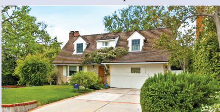
2751 Motor Ave – $2,195,000