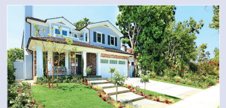
2715 Forrester Dr – $4,999,000