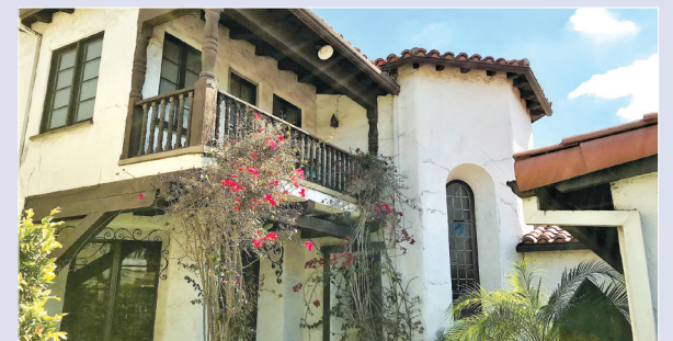
2742 Forrester Dr – $2,625,000

5 Bed / 5 Bath 3,842 Sq. Ft., 7,444 Sq. Ft. Lot