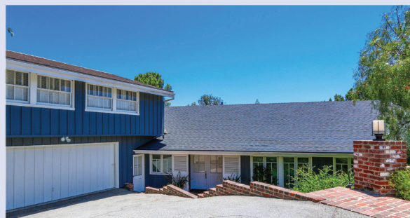
500 Hanley Pl – $2,999,000