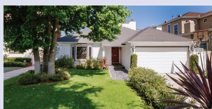
10523 Dunleer Dr – $2,250,000