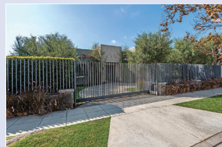
2771 Forrester Dr. - $6,650,000 5 Beds / 6 Bath, 4,473 Sq. Ft.