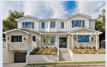
664 Kingman Ave - $9,995,000

UNDER CONSTRUCTION Disclaimer: image is used for illustrative purposes only and may not be exact representation of the final product.