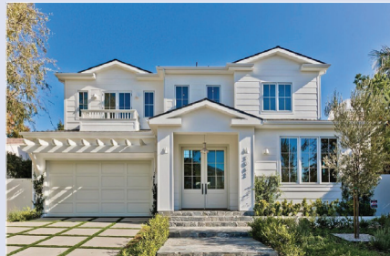
2856 Forrester Dr. - $8,495,000

UNDER CONSTRUCTION Disclaimer: image is used for illustrative purposes only and may not be exact representation of the final product.