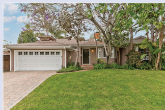
3257 Provon Ln. - $1,795,000 3 Beds / 2 Bath, 1,702 Sq. Ft.