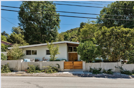
3380 Mandeville Canyon - $2,449,000 3 Beds / 2 Bath, 2112 Sq. Ft., 7840 Sq. Ft. Lot

A picturesque mid-century mountain cabin, nestled within the pastoral beauty of Mandeville Canyon, this home is rustic country living mere moments north of Sunset. Located in the coveted Kenter Canyon/Paul Revere/Palisades Charter district, this much cherished home deserves your immediate attention.