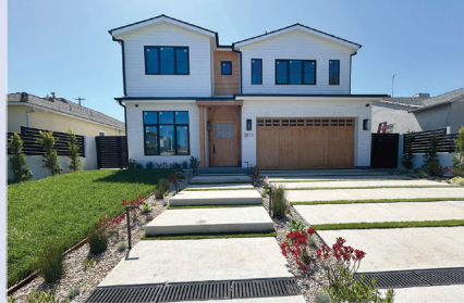
2811 Oakhurst Ave - $4,195,000 5 Beds / 5 Bath + 1 Bed / 1 Bath ADU, 3511 Sq. Ft. + 331 Sq. Ft. ADU, 6249 Sq. Ft. Lot

A brand new traditional-style construction with modern flourishes, this stunning two-story home is as impressive as it is inviting. Located on a quiet, family friendly street in Beverlywood, the home offers light hardwood floors, exceptional natural light, high ceilings and grand open spaces, this fine property has many highlights to share. Created with a well crafted designer's eye, there is a vision at every turn. The lovely backyard features a covered pergola, swimming pool, hot tub and plenty of lawn on which to play. Situated on a vast 6249 sq ft lot and located a short distance to the award winning Castle Heights Elementary School, this house is definitely not one to be missed!