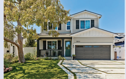
3211 Castle Heights Ave. - 5 Beds / 4 Bath, 2971 Sq. Ft., 8750 Sq. Ft. Lot

Effortless, elegant, exquisite. This home has been created with the needs of today's family in mind. With no design detail spared, an open floor plan with lightly hued hardwood floors creates an easy, breezy flow from the foyer to living room to kitchen. The front two bedrooms provide lovely, far reaching views and the Master Bedroom suite includes a large walk-in closet and a beautiful bathroom with a tub from which one can enjoy a lovely treetop view. Additional amenities include: upstairs laundry room, attached two car garage, a plethora of closet and storage space and is located walking distance to the award winning Castle Heights Elementary School. If you've been hoping to find a beautiful, newly constructed home in a fabulous neighborhood then congratulations- your search is over. Welcome home!