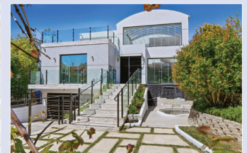
2927 Gilmerton Ave. - $20,000 /mo.