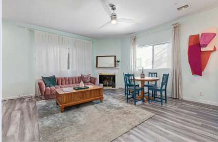
10760 Lawler Street #4 - $829,000 2 Beds / 2.5 Bath, 1,179 Sq. Ft.

Located on a quiet, leafy street and just a quick stroll to the Expo line, shops and restaurants in Palms - this townhouse in a secure building on Lawler is city living at its finest. Airy and bright, bold design choices give the home fun character and a strong personality. There is a built-in storage and art-display wall in the living room that also offers a fireplace and high ceilings. Upstairs are the large bedrooms, each with big closets, private balconies and beautifully designed bathrooms. Additional amenities include a skylight, in-unit washer/dryer, Nest temperature control, two tandem parking spaces in gated garage and an additional garage storage unit. Come see this beautiful townhome today!