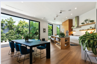
3221 Provon Ln. - $3,195,000 4 Beds / 3.5 Bath, 2830 Sq. Ft., 7900 Sq. Ft. Lot