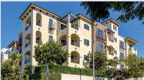
10345 Wilkins Ave #203 $1,099,000 2 Beds/2.5 Bath 1,446 Sq. Ft.

Efficient yet stylish and exuding a smart use of space, this condominium situated in a luxury building on the Westside is an ideal living solution. Only 16 units in a building built in 2011. A stone's throw from the shops and restaurants of Westwood, Beverly Hills and Century City, this sophisticated condominium is a sight to behold.