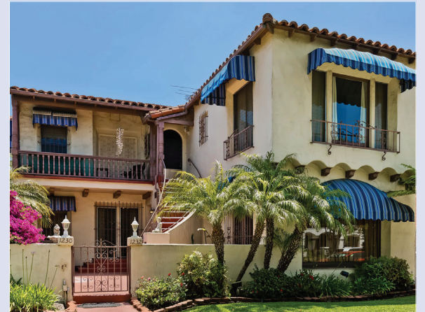
1230 Hi Point St. $2,049,000 Duplex with 3 Beds/2 Bath Each 3,818 Sq. Ft., 6,520 Sq. Ft. Lot

A Spanish style duplex in a residential neighborhood conveniently located near the mid-city/Pico-Robertson area, these homes embody the integrity of their era without sacrificing ease of modern living. Original details include: hard wood floors, thick adobe walls, coved ceilings, crystal fixtures and doorknobs, oversized windows that overlook flowering Bougainvillea and flood the interior spaces with light. Each unit is roughly 1900 square feet and offers 3 big bedrooms/2 bathrooms. The bathrooms are a designer's dream: original, colorful tile work reminiscent of old Hollywood. These units offer the best of both worlds: charm and character of yesteryear with today's most useful feature: a fully remodeled kitchen. New cabinetry for extra storage and stainless, high-end appliances will make any at-home chef happy. With plenty of surrounding space and situated in a pleasing location mere steps from shops and restaurants of Pico, these homes are city living at its finest.