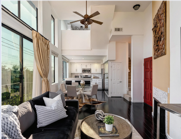
869 S Wooster St #309 $799,000 2 Beds/2.5 Baths

With impossibly high ceilings and wall to wall glass doors/windows that bask the entire space in glorious natural light, this split-level condominium is the essence of smart and stylish city living. There are two bedrooms, each en suite with a bathroom and lovely views. There's a cozy living room with a fireplace and a wrap-around balcony. The kitchen is modern, bright and airy offering clean white Caesarstone countertops, convenient breakfast bar and all stainless Frigidaire appliances. Midway upstairs you'll find a loft office with customized built in bookshelves and a private bathroom. A few more steps beyond, open the door to a fantastic rooftop deck with city views as far as the eye can see, ideal for sophisticated social get-togethers, sunbathing or nighttime stargazing. Additional amenities include: in unit washer/dryer, secure entry, 2-car garage parking and plenty of storage. Ideally located on a quiet residential street near Beverly Hills, make this fabulous condo your next home!