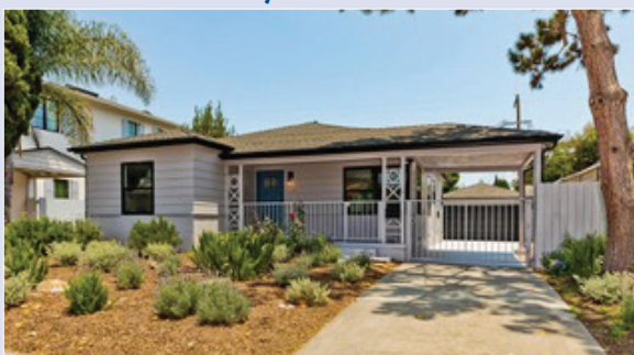
3232 S. Beverly Drive $1,595,000 3 Bed / 2 Bath 1,356 Sq. Ft.