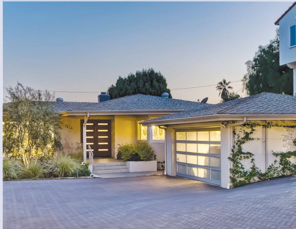
9820 Burgen Ave. $2,600,000 3 Beds/3 Baths 2,942 Sq. Ft., 9,749 Sq. Ft. Lot

With cool, slate-grey wood floors, open interior spaces and a sophisticated, minimalist aesthetic, this chic and inviting home is unlike any other house on the market today. Oversized Anderson windows allows the house to be basked in natural light while providing pleasant views of greenery and landscaping at every turn. The stylish kitchen offers a cozy breakfast banquet, an array of sleek custom cabinetry, monochrome Caesarstone countertops, designer backsplash and top-of-the-line stainless appliances including a Wolf range, Samsung dishwasher and space efficient in-island microwave. There's an intimate living room and formal dining room that is anchored by a stately corner fireplace that envelops the entire space with warmth. The master features a large cedar closet and overlooks the beautiful backyard below. Additional amenities include: a brand new dual zone HVAC system, recessed lighting, sunken tub & Biobidet toilet in the master bath, Nest temperature control, two car detached garage, separate laundry room and an enviable location on a quiet street in the Castle Heights Elementary School District.