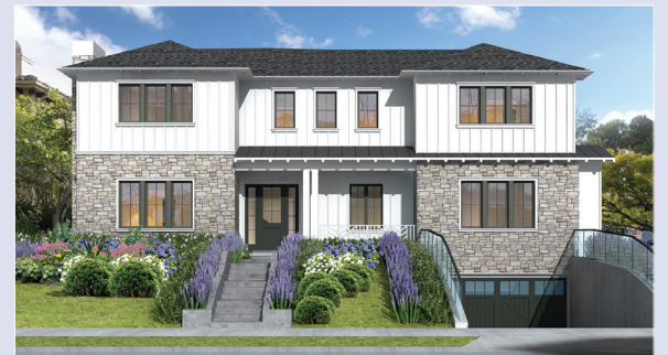
- GLENBARR - Best Location in the Neighborhood! 6 Beds/TBD Bath 7,500 Sq. Ft., 8,500 Sq. Ft. Lot

You may be curious about the new construction homes being built on Glenbarr and Lorenzo. Call Ben (310-704-6580) or send him an email ( ben@benleeproperties.com ) to learn more about these spectacular properties that will undoubtedly be the crown jewels of the neighborhood.