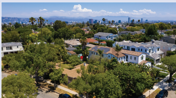
9149 Cresta Drive $4,200,000 4 Beds/4 Bath 2,822 Sq. Ft., 14,744 Sq. Ft. Lot