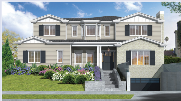
- LORENZO - Best Location in the Neighborhood! 6 Beds/TBD Bath 7,500 Sq. Ft., 8,500 Sq. Ft. Lot

You may be curious about the new construction homes being built on Glenbarr and Lorenzo. Call Ben (310-704-6580) or send him an email ( ben@benleeproperties.com ) to learn more about these spectacular properties that will undoubtedly be the crown jewels of the neighborhood.