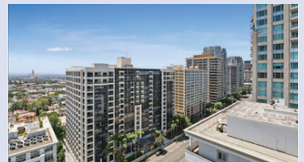
10701 Wilshire Blvd #1605 $630,000 1 Bed/2 Bath 1,099 Sq. Ft.