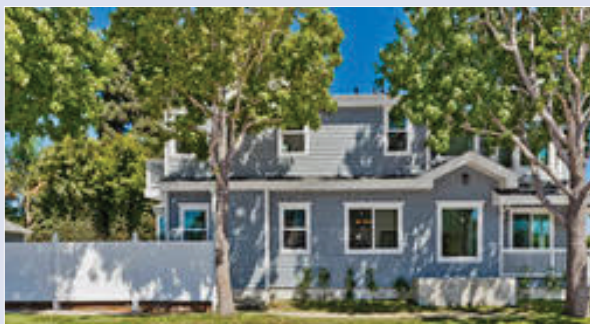
9139 Hargis St – $2,200,000 4 Bed / 4 Bath 2,500 Sq. Ft., 4,989 Sq. Ft. Lot