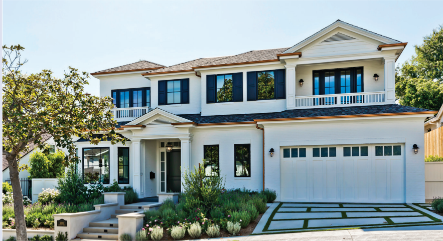
3001 Cavendish Dr – $6,495,000 6 Bed / 8 Bath 7,858 Sq. Ft., 8,756 Sq. Ft. Lot

A newly constructed palatial estate; grand in scale yet welcoming and warm, this breathtaking traditional style, state-of-the-art home is a premier example of what other new constructions aspire to be. Fully basked in light and following an airy and open floor plan, from the first step over the threshold, visitors and inhabitants would agree that this home is an enviable work of art. There are three floors to the property and the entry level, surrounded by natural light and views of greenery, includes a formal living room with fireplace, formal dining, private office, guest bedroom suite, exquisite kitchen, breakfast nook and great room. Additional features include two laundry rooms, a convenient mudroom, attached two-car garage, walk-in pantry, butler's pantry and a multitude of storage rooms. This home is an architectural triumph and you deserve to see it for yourself today.