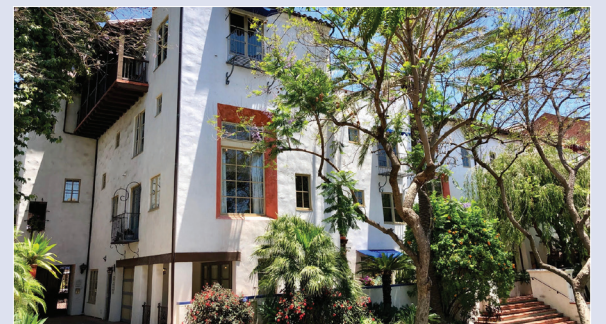
1414 N Harper Ave #4 – $1,615,000 4 Bed / 3 Bath 2,290 Sq. Ft.