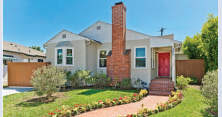
9408 Kramerwood Pl – $1,349,000 3 Bed / 2 Bath 1,459 Sq. Ft., 5,344 Sq. Ft. Lot

An elegantly manicured home with an abundance of light, this 3 bedroom/2 bath in Beverlywood makes efficient use of space without sacrificing character. Situated on a quiet cul-de-sac, the open floor plan in the front section of the home is tailor made for entertaining. The cozy living room is overlooked by the spacious and inviting kitchen. Here you'll find important design details set against a tranquil backdrop: architecturally inspired pendants, stainless Wolf oven/range, built-in Subzero refrigerator/freezer, a stone accent wall, and an oversized island with Farmhouse sink. A skylight above and windows all around bask the entire space in natural light. The entire yard is hugged by tall trees and hedging, providing absolute solitude and privacy. Additional amenities include: Nest temperature control, Ring doorbell, separate laundry area, hardwood floors and a detached two car garage. Located in a friendly neighborhood and a stone's throw from Castle Heights Elementary School, this delightful home is a must-see!