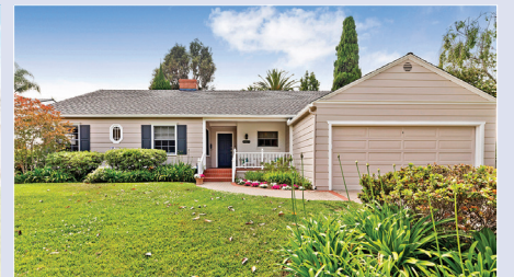
3029 Cavendish – $2,575,000 4 Bed / 3 Bath 2,592 Sq. Ft., 8,750 Sq. Ft. Lot

THE RESULTS ARE IN FOR 2018 AND BEN LEE IS TOPPING THE CHARTS!*