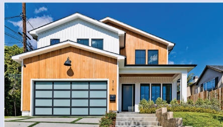
3118 Patricia Ave – $3,295,000 5 Bed / 6 Bath 4,102 Sq. Ft., 7,111 Sq. Ft. Lot