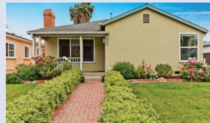
2922 Castle Heights Ave – $1,349,000 2 Bed / 2 Bath 1,405 Sq. Ft., 7,342 Sq. Ft. Lot