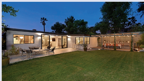
9833 Vicar St – $2,590,000 5 Bed / 3 Bath 2,686 Sq. Ft., 9,749 Sq. Ft. Lot