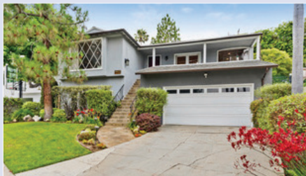
9417 Beverlywood St – $2,049,000 3 Bed / 3 Bath 2,754 Sq. Ft., 8,212 Sq. Ft. Lot