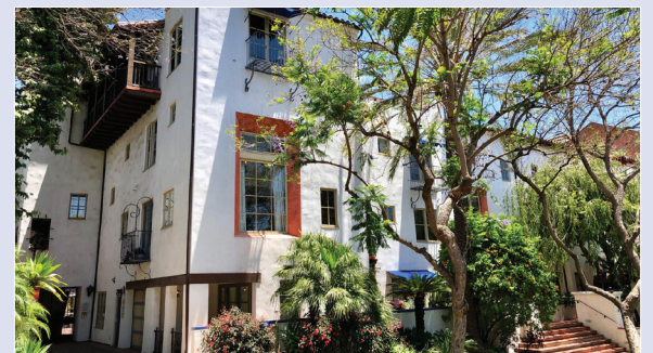
1414 N Harper Ave #4 – $1,615,000 4 Bed / 3 Bath 2,290 Sq. Ft.