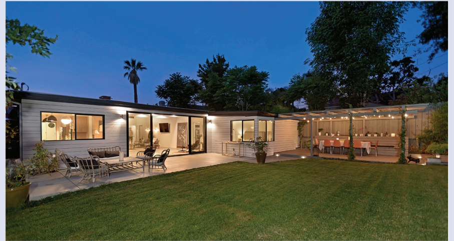
9833 Vicar St – $2,590,000 5 Bed / 3 Bath 2,686 Sq. Ft., 9,749 Sq. Ft. Lot

Welcome home to this unique and chic, mid-century modern, single-story masterpiece. This home, inspired by Neutra, embodies the essence of luxury Palm Springs living while conveniently situated in the heart of Cheviot Hills. The vast expanse of indoor to outdoor space stretches from the sun dappled entrance all the way past the lush backyard and beyond, creating an airy, endless flow; exactly what California dreams are made of. The living room seamlessly melds with the formal dining room creating a welcoming social hub, ideal for game nights and dinner parties. The beautiful backyard is completely private courtesy of high reaching hedges and mature citrus trees that envelop and shelter the entire space. Outside you'll also find an enormous expanse of grass, oversized salt-water pool, hot tub and even a movie screen for showing films al fresco. An easy stroll to the Metro line and part of the award winning Castle Heights Elementary School district, this sleek and stylish home is a mid-century must see.