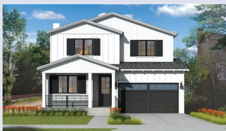
2751 Motor Ave – $3,795,000 5 Bed / 6 Bath 4,102 Sq. Ft., 7,111 Sq. Ft. Lot