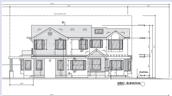
9139 Hargis St – $2,200,000 4 Bed / 4 Bath 2,500 Sq. Ft., 4,989 Sq. Ft. Lot