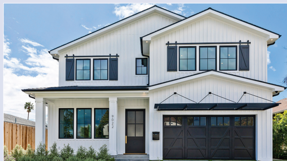
9022 Monte Mar Dr – $3,995,000 6 Bed / 7 Bath 6,458 Sq. Ft., 7,593 Sq. Ft. Lot