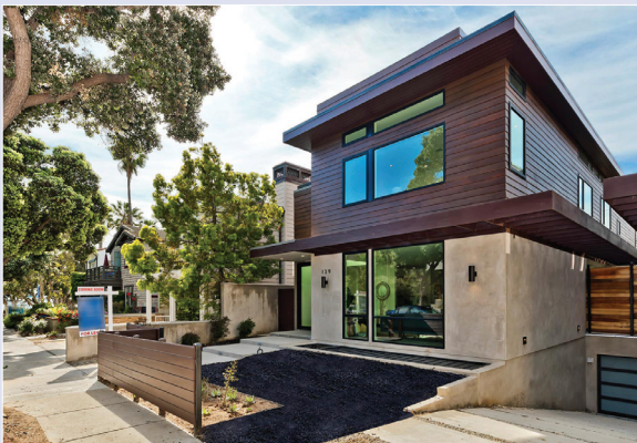
139 Hollister Ave for lease at $25,000 p/mo. 5 Bed / 6 Bath Approx. 5,000 Sq. Ft.

A unique opportunity to live in a state-of-the-art masterpiece mere moments from the beach, this absolutely stunning, brand new construction is a seashore adjacent fantasy come true. Sleek and modern, this incomparable property is minimalist in design yet abundant in warmth and luxury. Set in earthy, natural tones of glass and wood, step into the foyer and encounter an impossibly high skylight that basks the entire home in breathtaking sunshine. A vast, open floor plan allows an easy flow from the Great Room with built in art wall and adjoining wet bar to the formal dining room, and on to the magnificent entertainer's kitchen that includes top tier Wolf and Subzero appliances, an oversized island with prep sink and custom built cabinetry with infinite amounts of storage. Properties such as this one are virtually impossible to come by in this enviable enclave of Santa Monica. There is simply no time better than now for your chance to live the ultimate California dream.