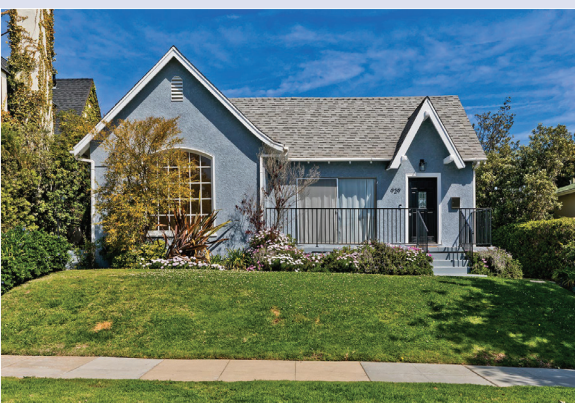
929 16th St $2,495,000 5 Bed / 4 Bath 2,601 Sq. Ft., 7,405 Sq. Ft. Lot

Seller may finance!!!! Live just moments from the beach and feel the cool ocean breezes from either unit of this pristine Santa Monica duplex. Each offers hardwood floors, comfortably sized rooms, closets and living spaces, immaculate kitchens with stainless appliances and oversized windows that let natural light stream into each home. Each unit also offers a wholly private and beautifully landscaped backyard, perfect for summer barbeques or evening cocktail parties. Located in one of the most enviable sections of Santa Monica: nestled an arm's reach between the chic shops and restaurants of Wilshire and Montana Avenue, this unbelievable opportunity is not to be missed.