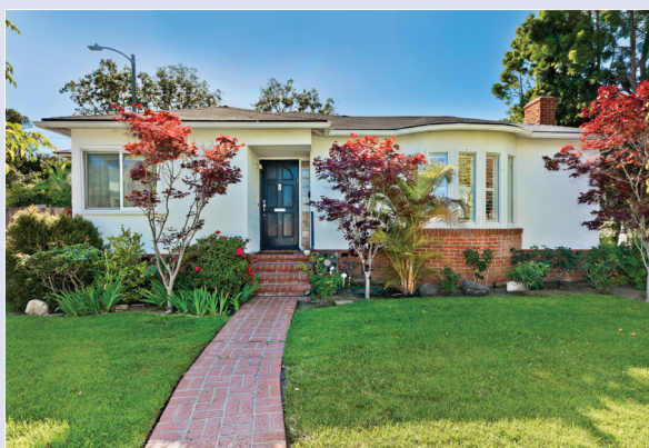
3009 Castle Heights Ave $1,399,000 3 Bed / 2 Bath 1,546 Sq. Ft., 5,022 Sq. Ft. Lot

A cheerful, traditional style home with exquisite landscaping on a large corner lot ideal for raising a family. Design details include intricate crown moldings, hardwood floors, Bay window with Plantation shutters and stately fireplace in the formal living room. The three bedrooms are large and comfortable- a Murphy bed allows flexibility to easily convert one bedroom into an office. A short stroll to sweet neighborhood park and situated in the award winning Castle Heights Elementary School district, this attractive home will make its next inhabitants happy for years to come.