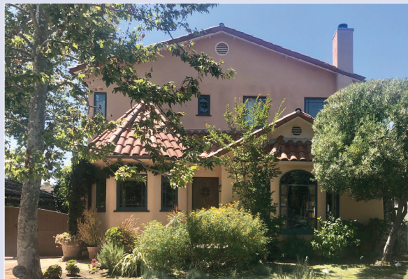
3043 Oakhurst Ave $1,849,000 4 Bed / 2.5 Bath 2,163 Sq. Ft., 5,000 Sq. Ft. Lot

Inspired by the lush tapestry of Tuscany's countryside, step into this home and experience a bit of Italy in Beverlywood. From the Batchelder tiled fireplace and paned, arched bay windows in the living room to the richly landscaped backyard, every detail in this newly painted, two story, hardwood floored home exudes romance. Built in 1928 and remodeled to create more space, features include: an enormous master suite with walk-in closet, master bath with steam shower plus an adjacent, sun-filled room that could double as a conservatory, nursery, gym or office. The private backyard is an idyllic paradise with mature fruit trees, new garden deck, cascading Bougainvillea and a storybook walkway that leads to the converted garage/artist's studio, nestled within a canopy of greenery and foliage. Located on a quiet, friendly street in the award winning Castle Heights Elementary School district, this home is a true neighborhood gem that deserves your immediate attention.