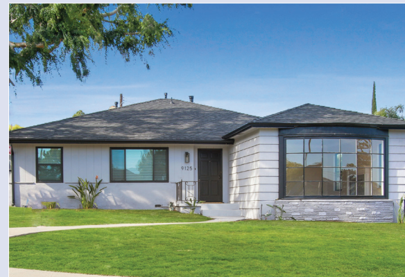
9125 David Ave for lease at $7,500 p/mo. 4.5 Bed / 3 Bath 2,392 Sq. Ft.

Be the first to occupy this newly renovated, 4.5 bedroom/3 full bath, 2392 sq ft home on a vast, corner lot in the heart of Beverlywood with a few of downtown and a swimming pool. Fresh and clean, the home has been completely remodeled without sacrificing original character. Features include: new hvac, brand new stainless appliances, counters and cabinets in the kitchen, all new plumbing fixtures and tile in the bathrooms, hardwood floors, Bay windows, stone fireplace in the den and a drought resistant backyard with a beautiful swimming pool, ideal for the upcoming summer months. There is a formal living room, formal dining room, breakfast nook, large bedrooms, ample closets and immaculate, fully renovated bathrooms. There is no shortage of space and storage possibilities. Located in the award winning Castle Heights Elementary School district, this is a unique opportunity to be the first residents of this meticulously remodeled home.