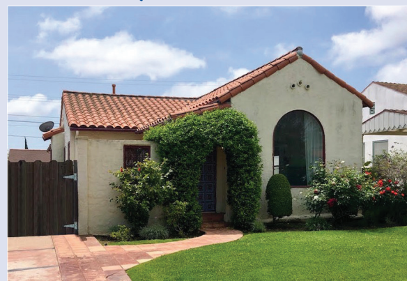
9112 Gibson St $1,290,000 3 Bed / 2 Bath 1,264 Sq. Ft., 5,001 Sq. Ft. Lot

A delightful Spanish style home on one of the friendliest streets in Beverlywood. The front door, a magical patchwork of color, sets the tone for what exists beyond: a picturesque and private front courtyard that leads to the main property. Inside you'll find all the special characteristics that give this architectural style such unique charm: thick adobe walls, curved archways, coved ceilings, hardwood floors and crystal doorknobs. Located in the award winning Castle Heights school district and a short stroll from the fun shops and restaurants of South Robertson, this house will not be on the market for long so make a point to see it today.