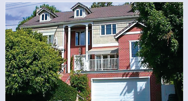
224 N Kenter Ave – $3,399,000

A vast property that incorporates elements of traditional and colonial styles, this estate in Brentwood has a multitude of features to please any potential buyer. Inside you'll find a formal living room with an abundance of light, hardwood floors, intricate crowned moldings and fireplace. There's a formal dining room that connects to the kitchen and also opens to a private, exterior courtyard. Upstairs you'll find the generously sized bedrooms, bathrooms and walk-in closets. In the coveted Kenter Canyon Charter Elementary School district, this home is a definite must see!