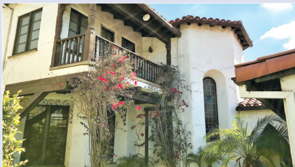
2742 Forrester Dr – $2,695,000 Great new price!

5 Bed / 5 Bath 3,842 Sq. Ft., 7,444 Sq. Ft. Lot