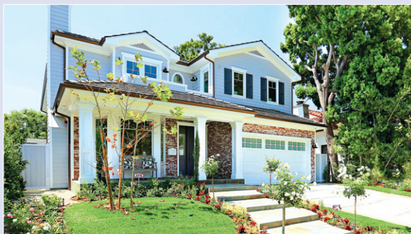
2715 Forrester Dr – $5,299,000 Great new price!

A luxurious Hamptons retreat on the most coveted street in Cheviot Hills, impeccably designed and newly constructed estate by Diamond West Distinctive Homes. Artfully detailed wainscoting and intricate custom built-ins. Greeted by a formal living room with fireplace and bay window, pass the formal dining room with butler's pantry to enter the gorgeous gourmet kitchen. This dazzling property, unmatched in location is truly an opportunity that cannot be missed.