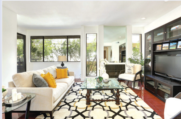
1830 Westholme Ave #207 – $824,000

A bright and spacious unit in a private and secure building, this condominium offers the most in quality city living. Sunny communal spaces, a welcoming living room with balcony, an elegant formal dining room and tasteful kitchen with granite counter tops, dual ovens and ample prep space. Windows throughout provide an abundance of natural light coupled with treetop views. There are three enormous walk-in closets, an almost unheard of amenity in the typical condominium. Additional features include: a separate office space (which could serve as a breakfast nook instead), formal powder room and laundry within the unit. The building offers a rooftop deck, swimming pool, two tandem parking spaces and an extra storage facility within the gated garage. Conveniently located near the shopping and dining areas of both Westwood and Century City (walking distance to the newly renovated Westfield Mall) and situated within the highly coveted Westwood Charter School District.