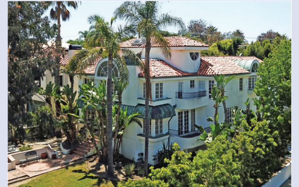
3035 Queensbury Dr – $3,499,000

A warm and welcoming family home built in an artistic Spanish architectural style, this exquisite property seamlessly blends chic California living with the New York City art scene and is arguably one of the most unique houses in the neighborhood. This home has much to offer a family in search of an alternative to cookie-cutter architecture. With multiple levels and an array of cozy lofts, balconies, landings and nooks, this home features an open floor with a bold personality all its own. Oversized windows and a dramatic central skylight provide abundant natural light in every room. The kitchen offers ample storage as well as granite countertops, Subzero refrigerator, breakfast nook and peninsula with extra seating. There's no shortage of community spaces for an active family: enormous playroom, formal living room with fireplace and sprawling backyard with swimming pool and entertaining patio. In the coveted Castle Heights Elementary School District, with convenient access to downtown.