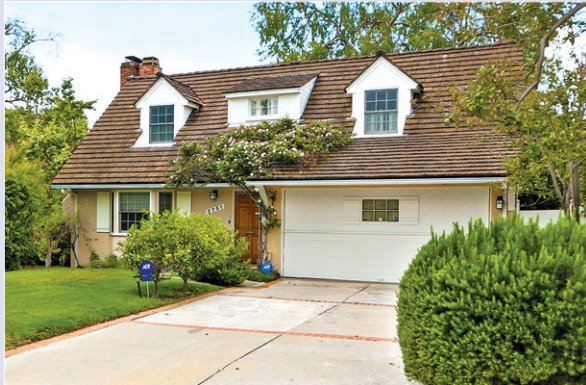
2751 Motor Ave – $2,195,000

A family home on a generously sized 8375 ft corner lot, nuanced in Southwestern detail with a hint of Santa Fe, this home feels like an inviting artist's retreat, brimming with inspiration and creativity. A multitude of bay windows and French Doors provide light and views from virtually every room. Hardwood floors and fireplaces bask the home in warmth and an abundance of cozy window seats and romantic nooks. The immense master bedroom suite has impressively high vaulted ceilings, oversized tub and plenty of storage spaces. In the kitchen there are stainless appliances and granite countertops. You can enjoy a tranquil view of the dining room and backyard beyond featuring a hot tub and long swimming pool that stretches the length of the outdoors. Upstairs is bursting with charm, reminiscent of a country cottage inn. Just a short distance from the Cheviot Hills Recreation Center and located in the award winning Overland Elementary School District.