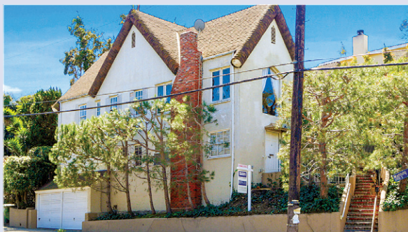
10552 Cheviot Dr – $1,499,000

4 Bed / 3 Bath 2,300 Sq. Ft., 6,505 Sq. Ft. Lot