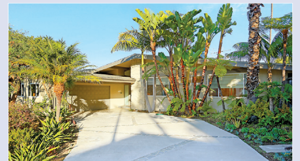
2826 Medill Place – $2,999,000 Great new price!

This is a rare opportunity to inhabit an authentic yet updated mid-century modern dream home with arguably one of the most breathtaking views in all of Cheviot Hills. Perfect for the connoisseur who appreciates the beauty and style of 1950's architecture yet with a modern-day sensibility. High ceilings and open dining and living spaces punctuated by floor to ceiling glass doors allows for light to pour in from every angle. Located in the award winning Castle Heights School district, this once-in-a-lifetime chance to call such a special property 'home' should not be missed.