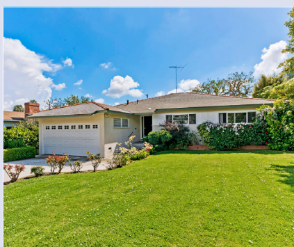
9832 Vicar St – $1,699,000