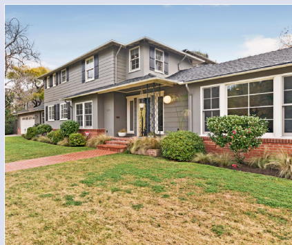
2880 Motor Ave – $2,995,000