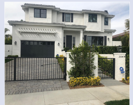
3049 Queensbury Dr – $2,149,000