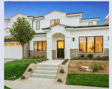
3043 Earlmart Dr – $4,795,000