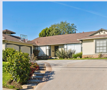
3225 Club Dr – $2,499,000