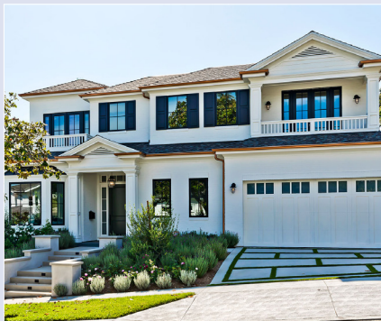
3001 Cavendish Dr – $5,999,000