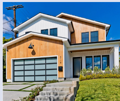
3118 Patricia Ave – $3,295,000