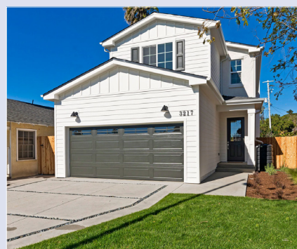
3217 Castle Heights Ave – $1,895,000