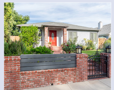
10637 Northvale Rd – $1,549,000