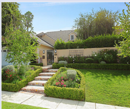
3062 Earlmart Dr – $2,575,000