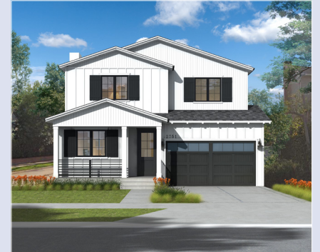
2751 Motor Ave – $3,675,000