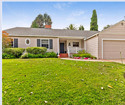
3029 Cavendish Dr – $2,599,000