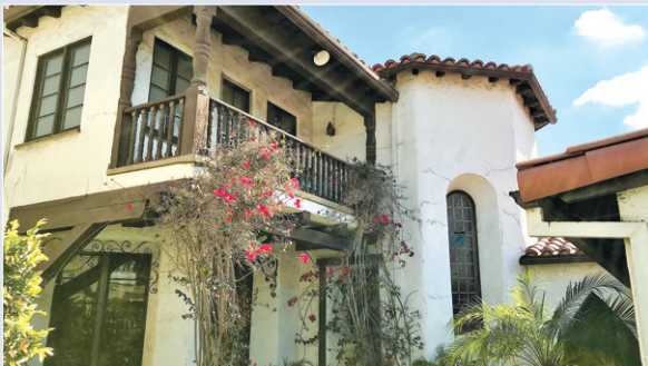
2742 Forrester Dr – $3,295,000

5 Bed / 5 Bath 3,842 Sq. Ft., 7,444 Sq. Ft. Lot