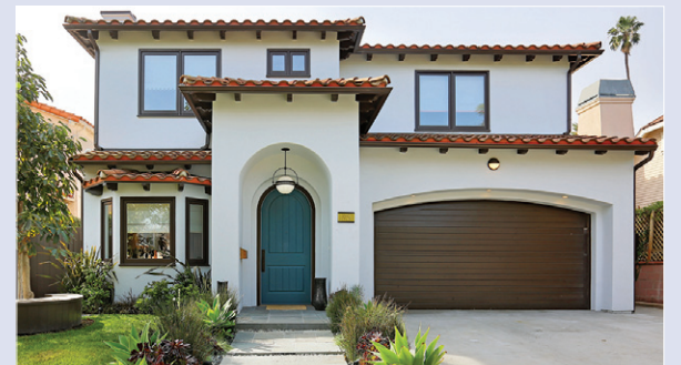
1951 Kelton Ave – $3,095,000

A symphony of colors and textures set against the backdrop of a recently remodeled, Mediterranean-style family home. The formal living room seamlessly merges with the formal dining room. These rooms extend to the expansive kitchen and great room, both featuring a glorious view of the picturesque backyard. Conveniently located in the highly coveted Westwood Charter Elementary School District and a stone's throw to all the shops and restaurants on Westwood Blvd.