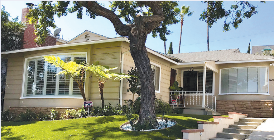
2407 Bagley Ave – $1,875,000

Warm and inviting, this traditional style is as charming as it is efficient. Perched above one of the most family friendly streets in the neighborhood. Oversized windows in every room allows for natural light to stream in from every corner. Hardwood floors, wainscoting and crowned moldings shape the personality of the formal dining room and living room. The kitchen offers attractive granite counters, stainless refrigerator and glass cabinetry. Located in the award winning Castle Heights Elementary school district, this winsome home is sure to bring comfort and happiness to whoever inhabits it next.