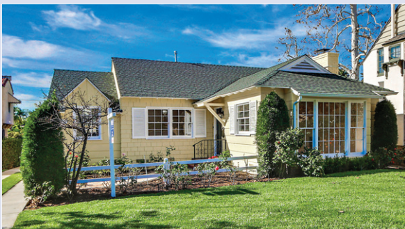
10272 Kilrenny Ave – $6,500 p/mo.