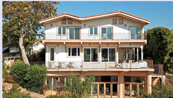
515 Muskingum Ave – $3,195,000 Great new price!

5 Bed / 4 Bath 4,100 Sq. Ft., 8,276 Sq. Ft. Lot