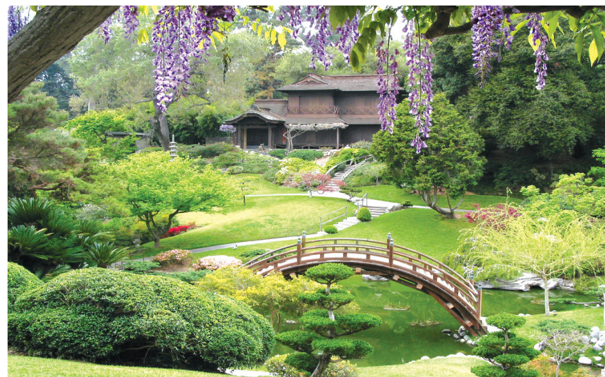
Huntington Library and Gardens

complete without enjoying the tea room which provides a high tea style lunch with an infinite variety of sandwiches, salads and desserts. This is a must see and must visit for everyone. The movies that have filmed there include, Mame, Charlie's Angels, the Wedding Planner, Memoirs of a Geisha and Romeo and Juliet. Even if you have been in the past a re-visit will always reward with new blooms and acquisitions and of course that tea room.