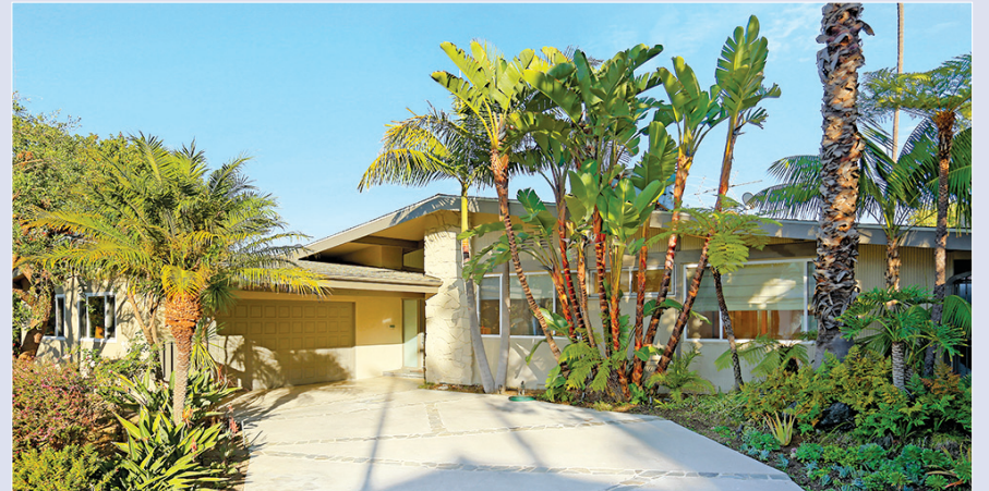
2826 Medill Place – $3,095,000

This is a rare opportunity to inhabit an authentic yet updated mid-century modern dream home with arguably one of the most breathtaking views in all of Cheviot Hills. Perfect for the connoisseur who appreciates the beauty and style of 1950's architecture yet with a modern-day sensibility. High ceilings and open dining and living spaces punctuated by floor to ceiling glass doors allows for light to pour in from every angle. Located in the award winning Castle Heights School district, this once-in-a-lifetime chance to call such a special property 'home' should not be missed.