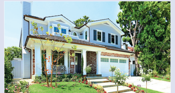
2715 Forrester Dr – $5,549,000 Great new price!

Luxurious Hamptons retreat on the most coveted street in Cheviot Hills, impeccably designed and newly constructed estate by Diamond West Distinctive Homes. Artfully detailed wainscoting and intricate custom built-ins. Greeted by a formal living room with fireplace and bay window, pass the formal dining room with butler's pantry to enter the gorgeous gourmet kitchen. This dazzling property, unmatched in location is truly an opportunity that cannot be missed.