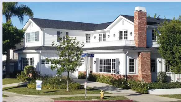
3001 Dannyhill Dr – $4,195,000

This newly constructed Newport-style home in the highly coveted Cheviot Hills' Country Club Estates. Hardwood floors, wainscoting and crown moldings throughout. Beyond the beauty of the kitchen is a view of the backyard complete with tropical palm trees, patio, pool, hot tub and pool house. Paired with the formal living room with marble fire place, formal dining room with butler's pantry and a temperature-controlled wine room, you are ready to entertain.