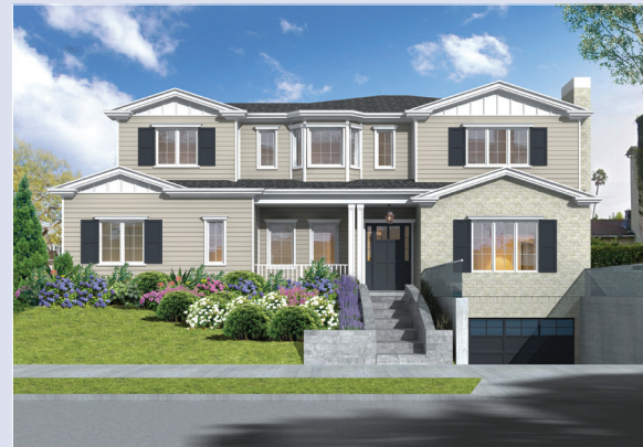
- LORENZO - Best Location in the Neighborhood! 6 Beds/8 Bath 7,500 Sq. Ft., 8,500 Sq. Ft. Lot

You may be curious about the new construction home being built on Lorenzo. Call Ben tel:3107046580 or send him an email mailto:ben@benleproperties.com to learn more about this stunning property.