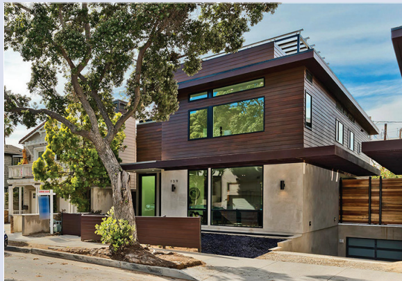
141 Hollister Ave for lease at $30,000/month 5 Beds/6 Baths 5,000 Sq. Ft.

Steps from Prime Santa Monica Beach! Gorgeous new 2020 construction, state-of-the-art masterpiece mere moments from the beach. Approx. 5,000 sq. ft. open floor plan allows an easy flow from Great Room to formal dining to magnificent entertainer's kitchen that includes top tier Wolf and Subzero appliances and over-sized island. The kitchen opens to the sophisticated and drought-resistant landscaped backyard. There are sliding pocket doors that completely open to an outdoor side deck dining area, ideal for parties al fresco. This ground level of the home also has a guest room and powder room. Downstairs features guest room, laundry room, gym/media room, kitchenette, an enormous storage room and access to the 3-car subterranean garage. Second floor with 3 en suite bedrooms + laundry rm. Luxe master has treetop views, walk-in closet and 5-star bath. 900 sq. ft. rooftop deck with firepit and hot tub.