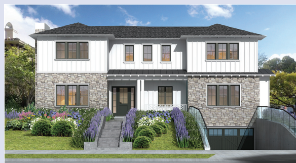
- GLENBARR - Best Location in the Neighborhood! 6 Beds/8 Bath 7,500 Sq. Ft., 8,500 Sq. Ft. Lot

You may be curious about the new construction home being built on Glenbarr. Call Ben tel:3107046580 or send him an email mailto:ben@benleproperties.com to learn more about this spectacular property.