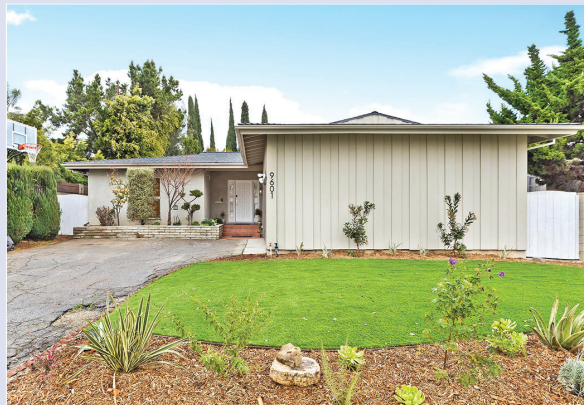
9601 Cattaraugus Ave $7,950 per month 3 Beds/2 Bath

This warm and inviting home in the Castle Heights neighborhood of Beverlywood has much to offer. Immaculate, remodeled and tastefully designed, there is a dramatic fireplace in the formal living room and hardwood floors throughout provide an effortless flow from each vast and generously sized room. The bedrooms have large closets with convenient built-ins for additional storage and one bathroom in particular has been totally remodeled with the added bonus of a European style super shower. The kitchen, a vision in black and white, provides an ideal entertaining space with oversized central-island, stainless high-end appliances and large pantry. With mature foliage surrounding the drought resistant backyard, enjoy dinner outdoors while enjoying absolute privacy. There's a beautiful deck and new trellis. Located mere moments from the award winning Castle Heights Elementary School, this home is a must-see.