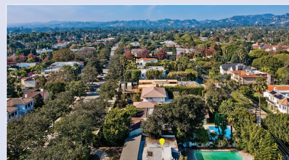
514 N Camden Dr $6,995,000 3 Beds/3 Baths 2,639 Sq. Ft., 12,859 Sq. Ft. Lot

Beverly Hills - SOLD! (over the list price in multiple offers)