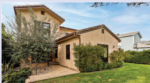
3029 Motor Ave $2,999,000 5 Beds/5 Bath 3,010 Sq. Ft., 6,985 Sq. Ft. Lot

Cheviot Hills - SOLD! (over the list price in multiple offers)